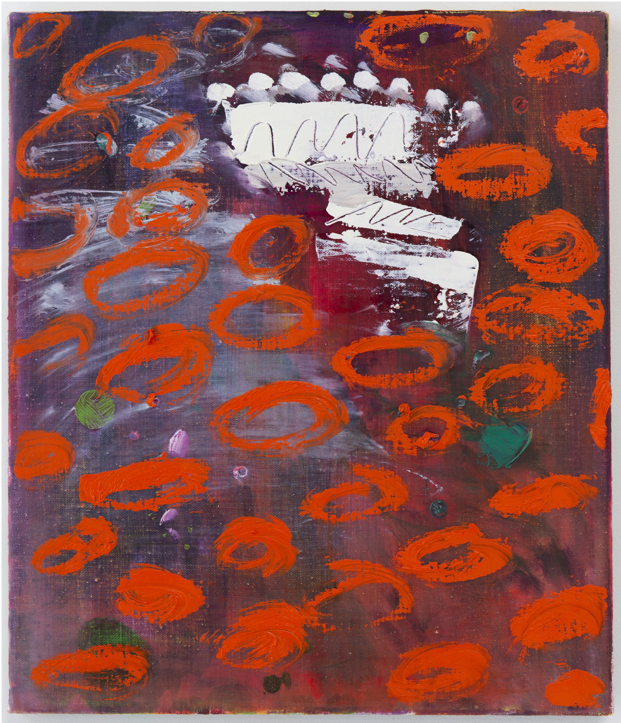
Vamp 2021 Oil and oil stick on linen 35,5 x 30,5 cm Unique