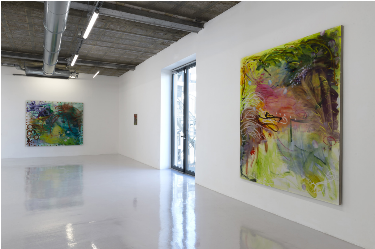
Exhibition views Up bubbles her amorous breath Air de Paris, Romainville, France 2022