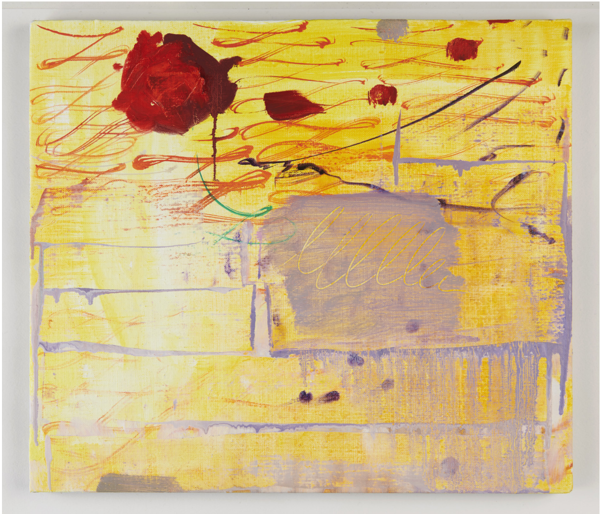
This fleeting 2024 Oil, acrylic and resin on linen 36 x 40,5 cm Unique