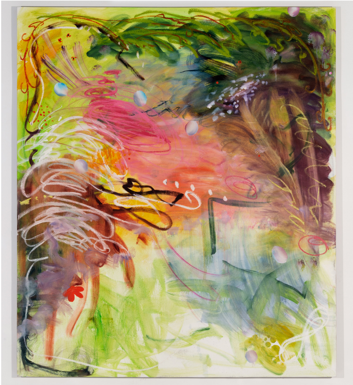
The light of ambivalence is a heavenly one 2021 Oil and oil stick on linen 213 x 183 cm Unique