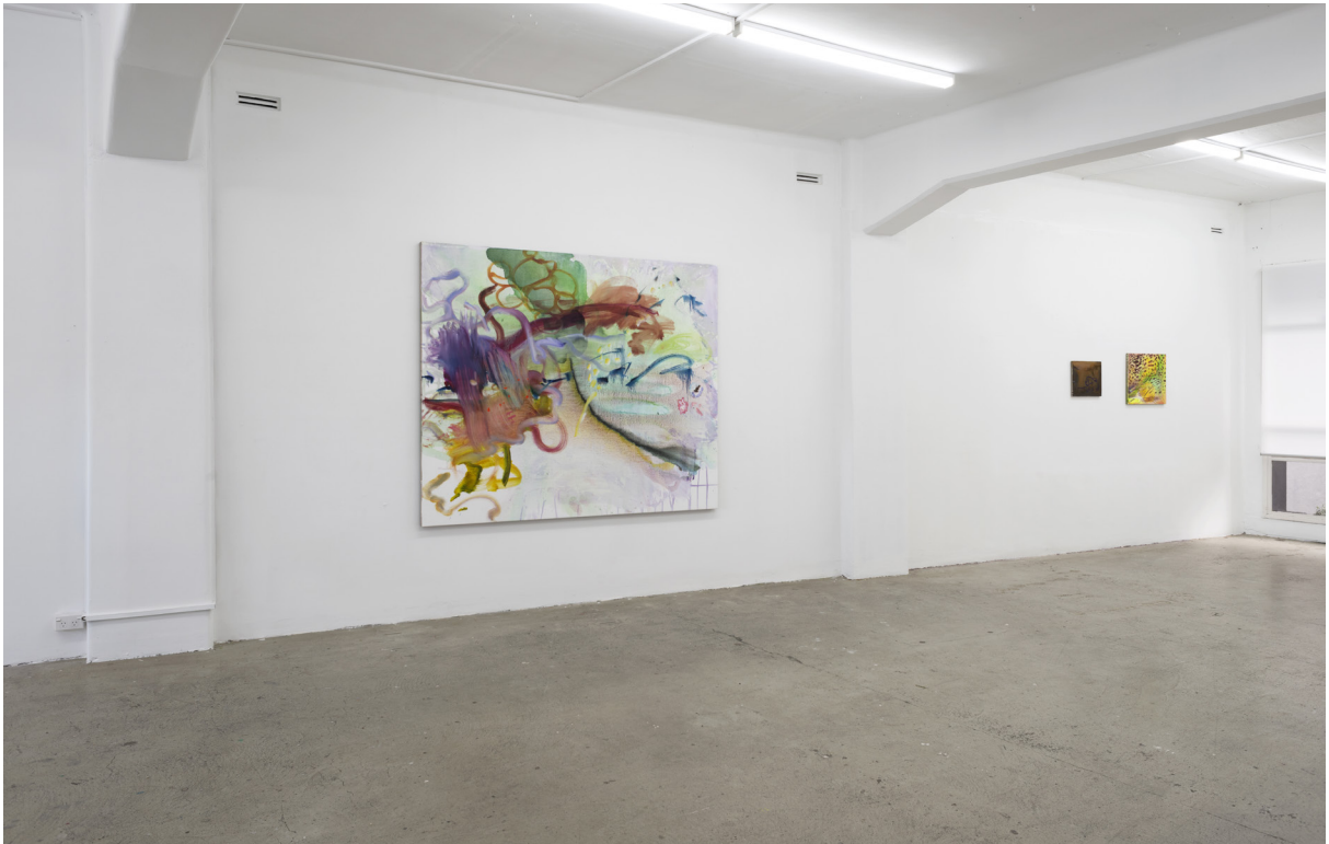
Exhibition views Madonna of the Pomegranate Coastal Signs, Auckland, New Zealand 2022