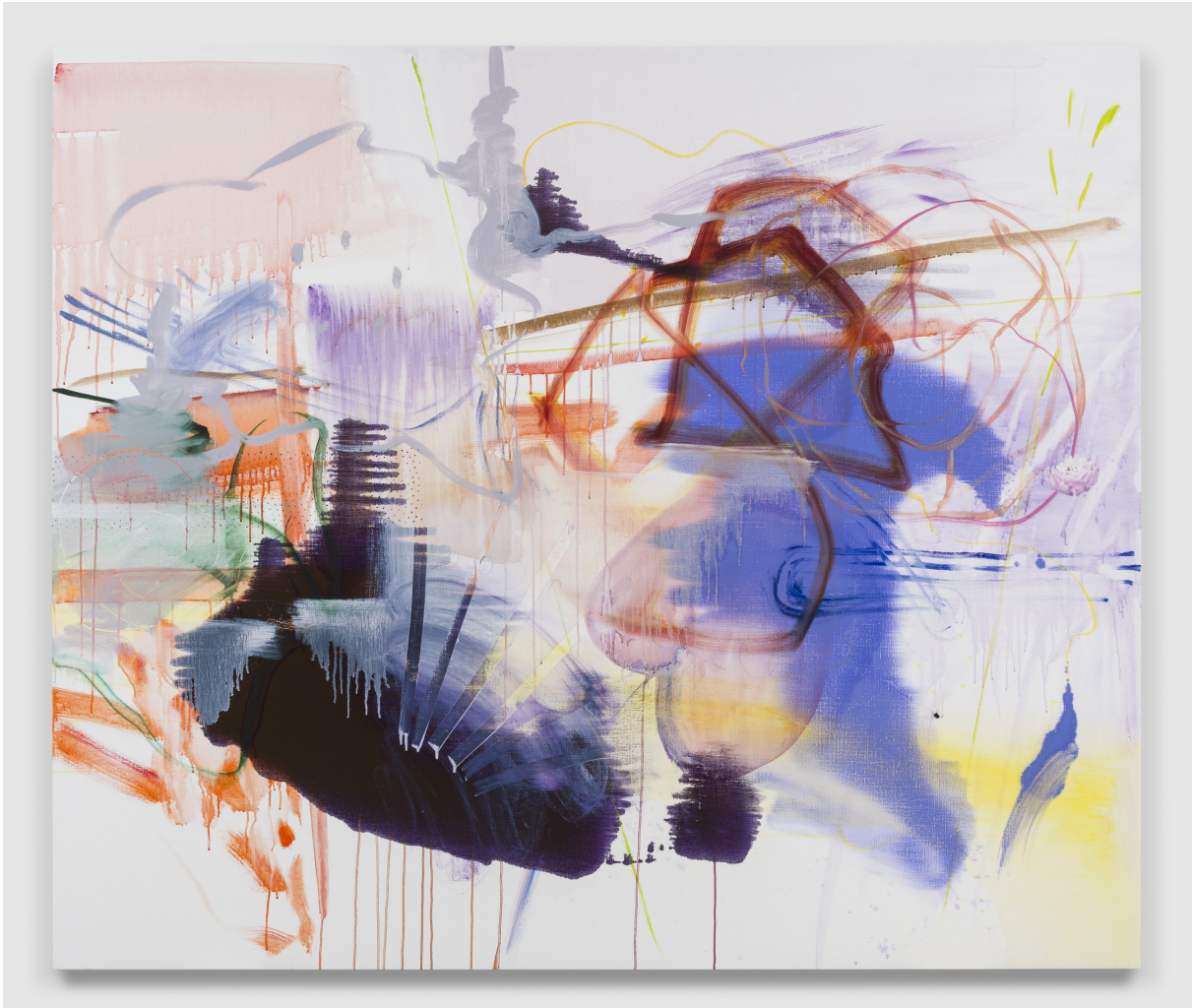
Poetry of brick and vapor 2023 Oil on canvas 182 x 213 cm Unique