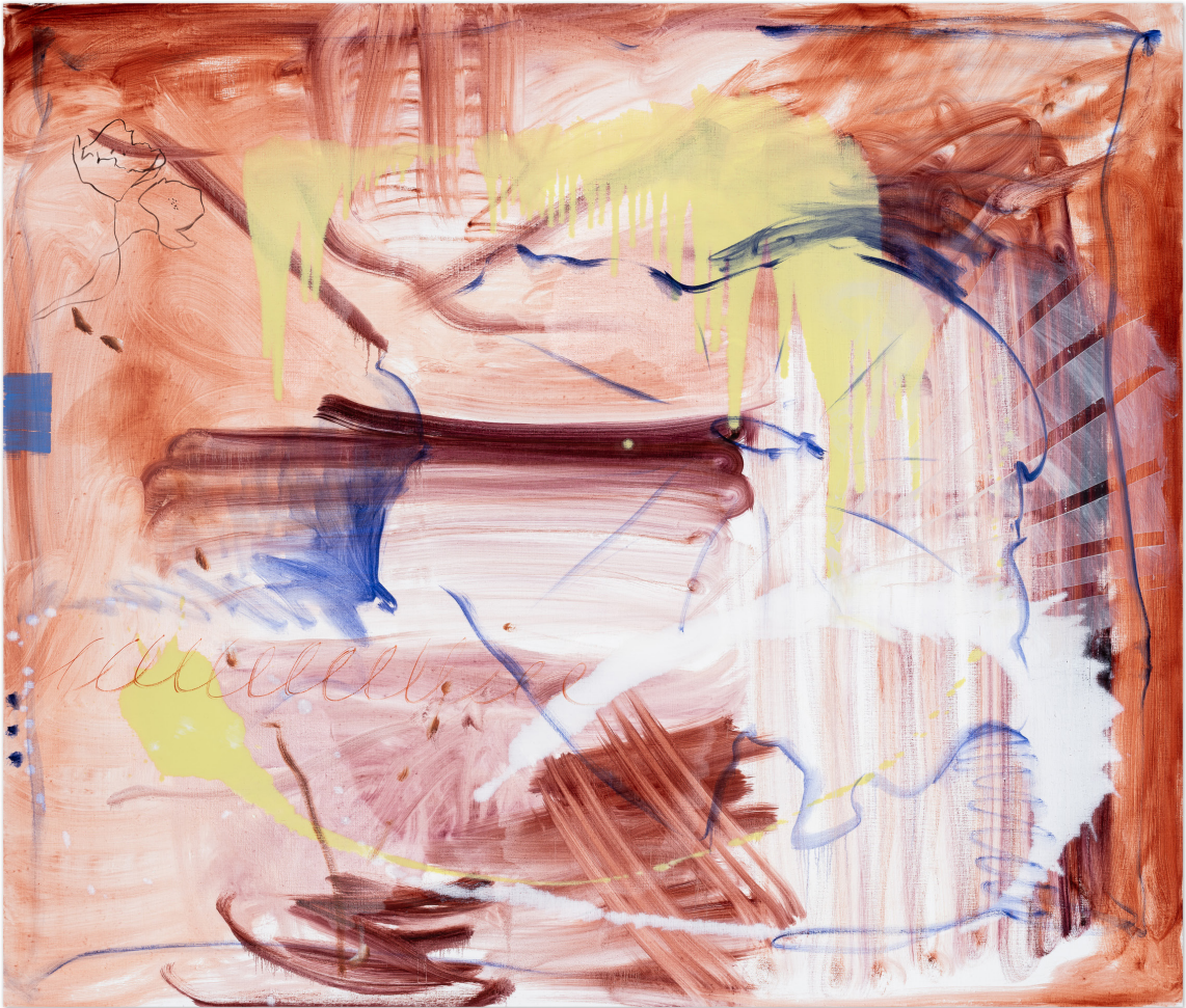
Persuasion 2024 Oil on canvas 152 x 172 cm Unique