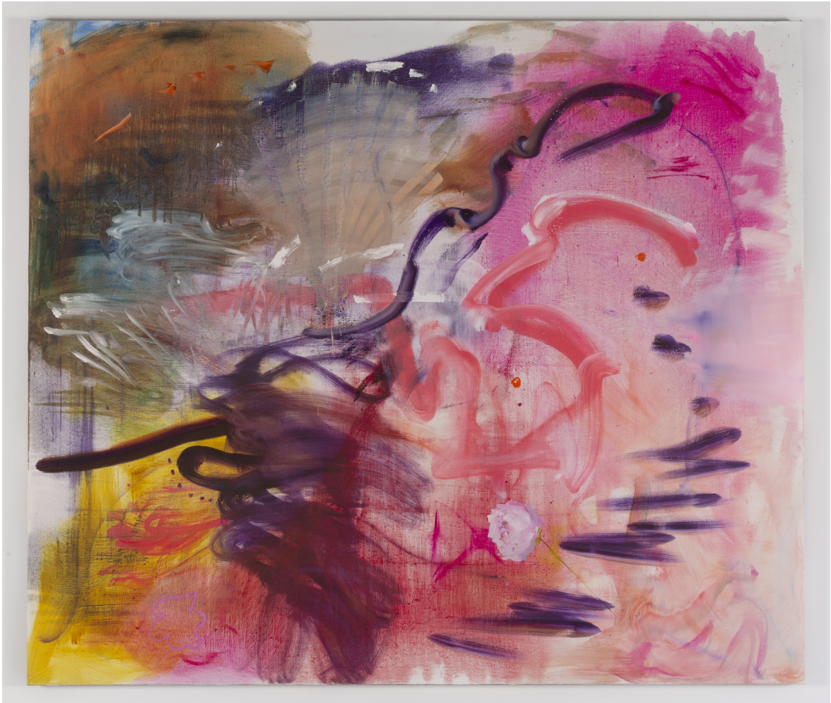
Indolent as flowers 2022 Oil and oil stick on linen, aluminium frame 182 x 213 cm Unique