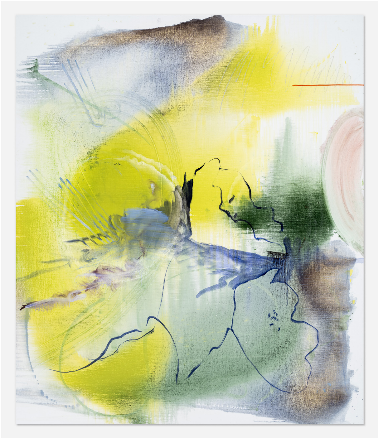
Fountain of Indolence 2024 Oil and oil stick on linen 200 x 170 cm Unique